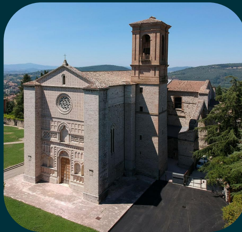
San Francesco al Prato Auditorium

A refined and elegant atmosphere will welcome us for an exceptional dinner and a series of special moments designed to honour the milestones we've achieved and renew our shared commitment to the future.