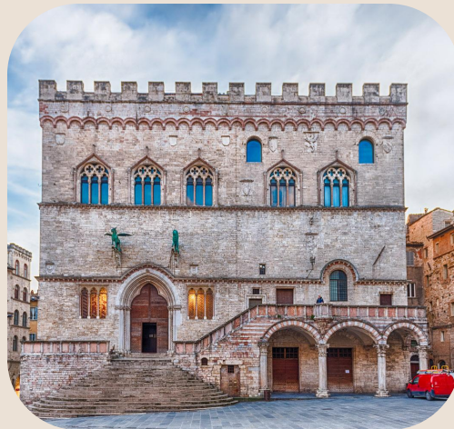
PALAZZO DEI PRIORI Sala dei Notari

Topics will include agri-food supply chains, export and international trade, legal protection and compliance and emerging trends transforming the food sector.